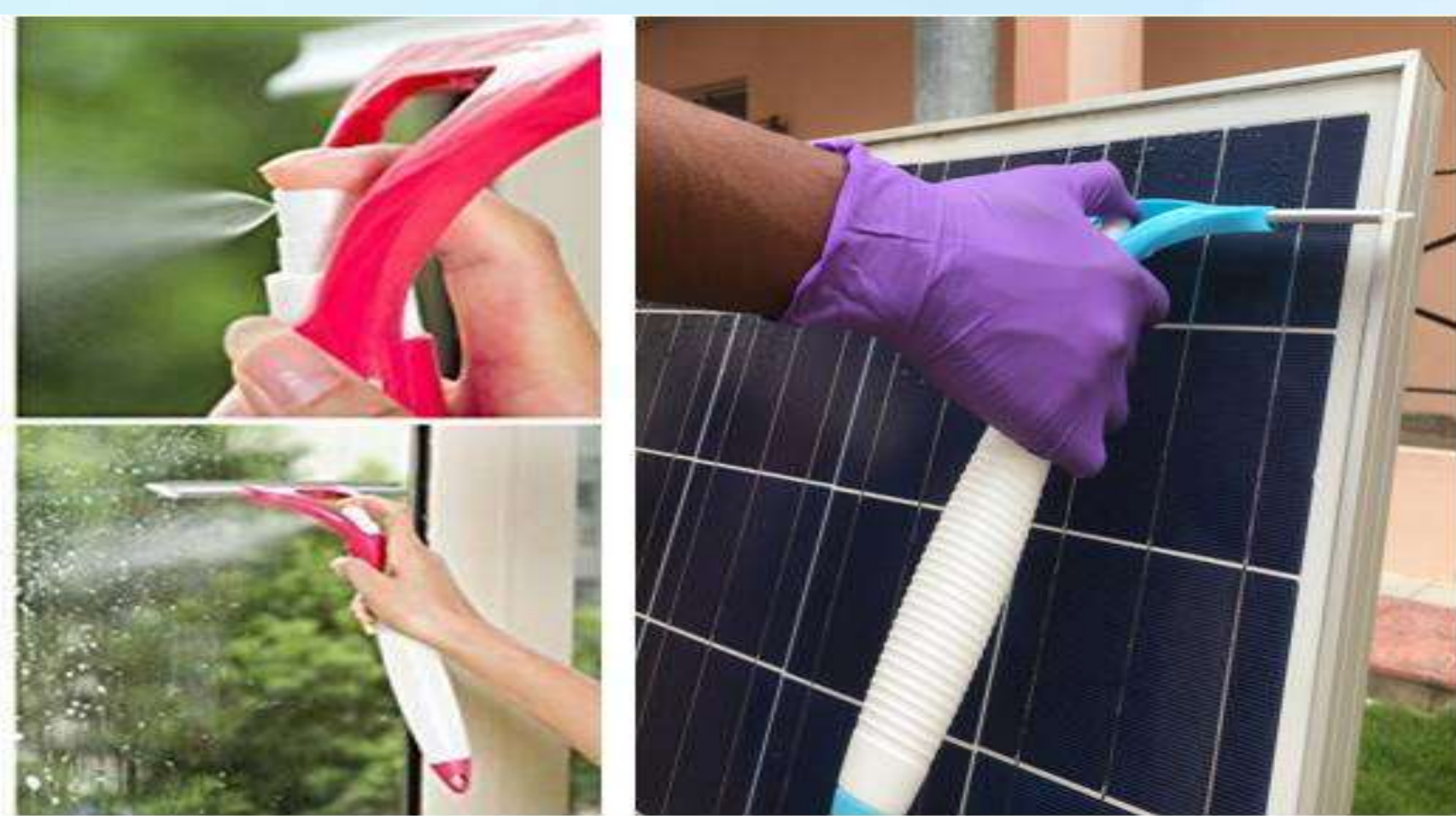
Easy-to-clean Coating by Spray & Wipe Method